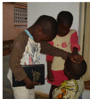
A P&S group in Guinea Bissau prays for each other.

In addition, NorthPointe's Home School Support Program used Pebbles and Stones as their chapel format every other week in the 2 day Core Academic Program. These students also enjoyed meeting in mixed age groups to journal and pray for each other. One parent remarked that this was why they were willing to pay to have their children come to school. The Pebbles and Stones time bound students, teachers, and parents together as they learned to share and pray together."