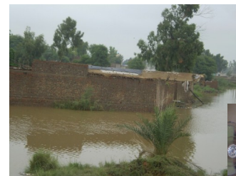
Floods Ravish Pakistan