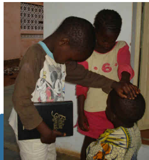
Children in Guinea Bissau praying for each Other during a Pebbles and Stones Meeting.